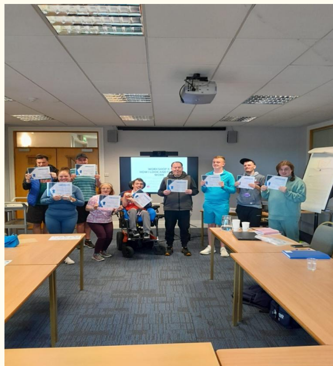
Work skills workshop participants

The WorkAbility team work closely with all our jobseekers and employers to ensure that each individual is ideally suited to the position.